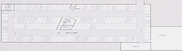
Grundriss Tiefgarage 1:500