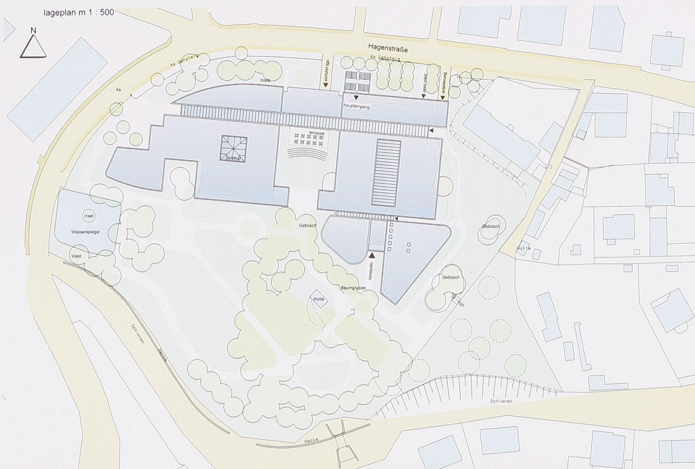
lageplan m 1 : 500